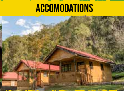
RINCÓN DE OJO DE AGUA

The cabins are located in the Magical Town of Jalpan de Serra, and are only 1.5km from the historical center and 250m from the Jalpan Reservoir (Ramsar Site). We have private cabins with capacity for families or larger groups.