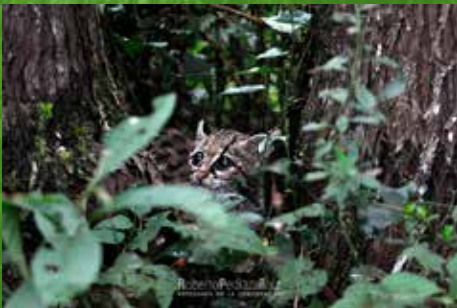
Protecting Wild Cat Habitat