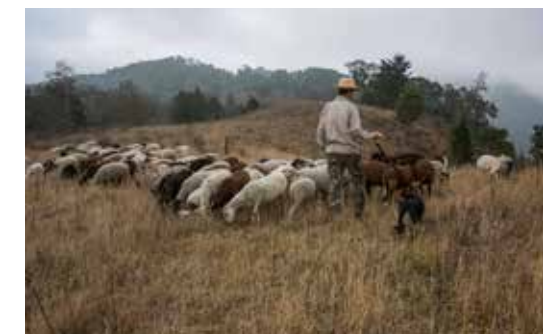
HOLISTIC MANAGEMENT TRAINING