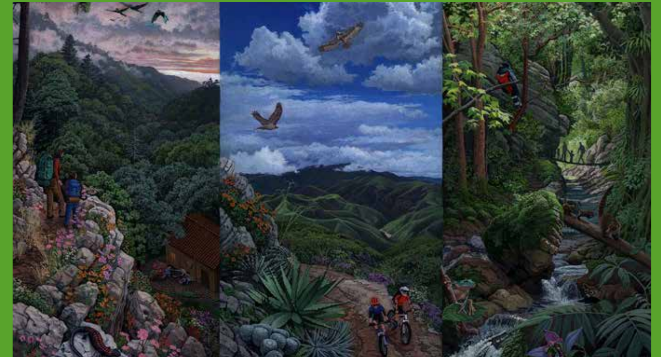
Illustration of Ecotours in the Sierra Gorda Biosphere Reserve. Artist: Aslam