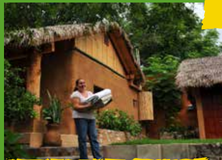
CABAÑAS CENTRO TIERRA

Each local owner and operator receives you with genuine warmth and hospitality and we collaborate with them to ensure an unforgettable experience and quality customer service. Groups and families can explore nature and visit them safely, as they explore the cliffs and gorges with the very people who care for and know most about the Sierra Gorda.