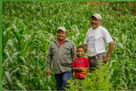
Support Young Environmental Leaders in Mexico