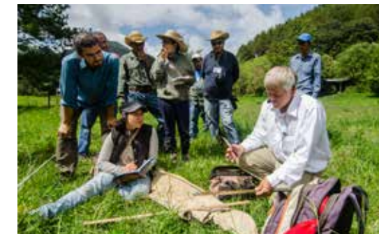
COURSES AND WORKSHOPS WITH EXPERTS