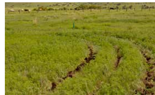
KEYLINE DESIGN - HYDROLOGICAL RECHARGE

SIERRA GORDA EARTH CENTER Teaching and learning best practices