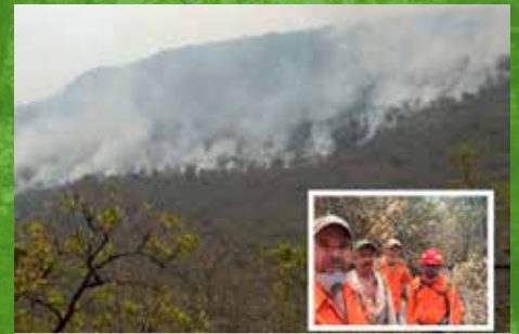
Train Local Brigades to Fight Forest Fires in MX