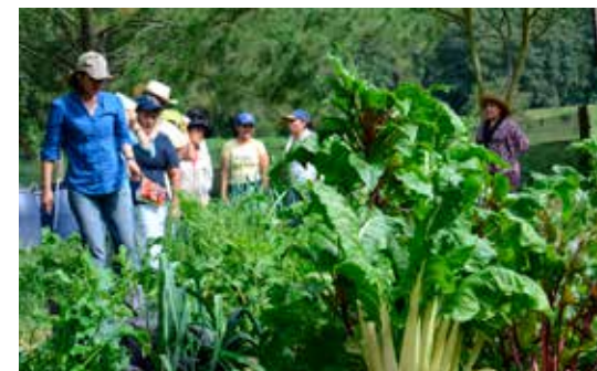
BIOINTENSIVE AGRICULTURE, NO CHEMICALS